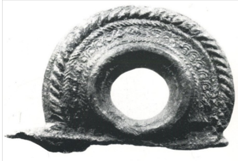
Fig. 1 Sítula's handle of Castrovite (A Estrada, Pontevedra) (Carballo 1986: Lam. XXX).